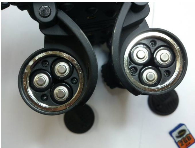
Battery compartment filled with batteries