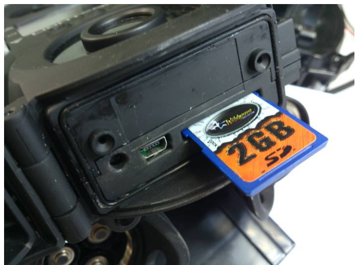
SD card slot