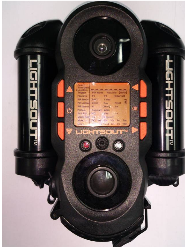
LO5 real product photo

The picture below is LO5 real product photo. There is a battery compartment in both sides, in which you can put batteries after screwing up the cover at the bottom. All the batteries should be put with positive pole in the outside . Open the SD card holder, you can see a reset key, a mini USB and a SD cart slot .