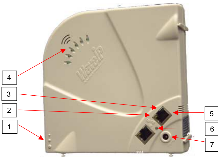
Figure 3-1: Description of Self Install GigAccess™ 900 RSU