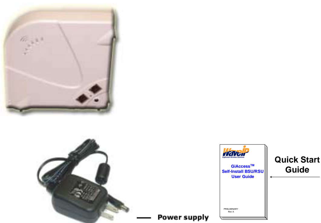
Figure 2-1: RSU package contents

Figure 2-1 illustrates the RSU package contents.