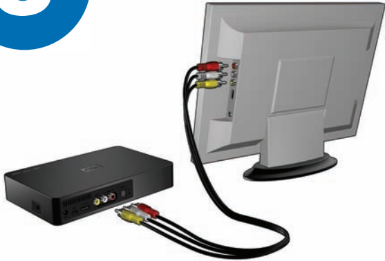
Composite cable (sold separately)