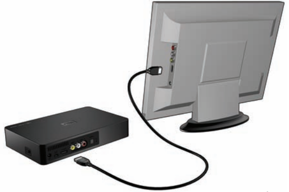
HDMI ® HIGH-DEFINITION MULTIMEDIA INTERFACE (sold separately)