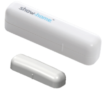
Door window sensor