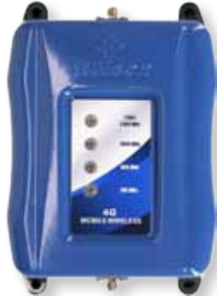
Mobile 4G Smart Technology III™ Signal Booster