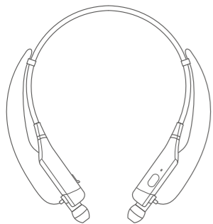
Hunter Bluetooth Headset