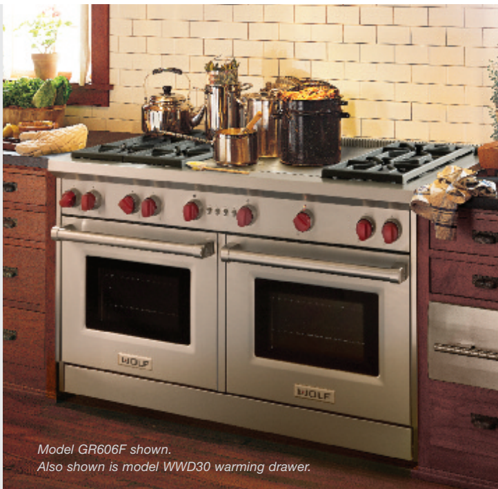
Model GR606F shown. Also shown is model WWD30 warming drawer.

Wolf has perfected the form, function and sheer durability of our gas ranges. Wolf gas ranges offer standard features such as an infrared oven broiler, convection baking, dual-stacked sealed surface burners and our signature large red control knobs. Optional infrared charbroiler, infrared griddle and French top give you the freedom to customize your gas range. Wolf gas ranges are available in natural or LP gas.