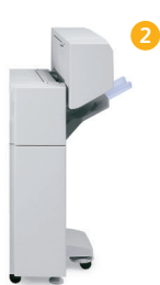
2 Office Finisher LX*