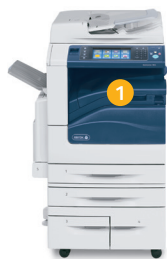
1 Integrated Office Finisher (Optional with 7830/7835)