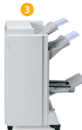
3 Professional Finisher