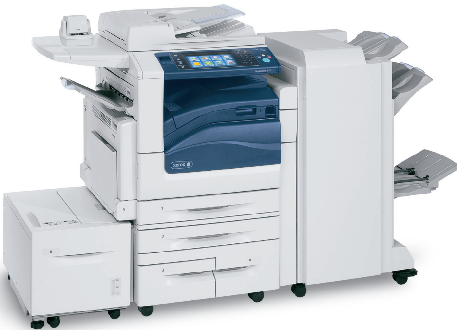
WorkCentre 7855 shown with optional Professional Finisher, Convenience Stapler and Work Surface and High Capacity Feeder.