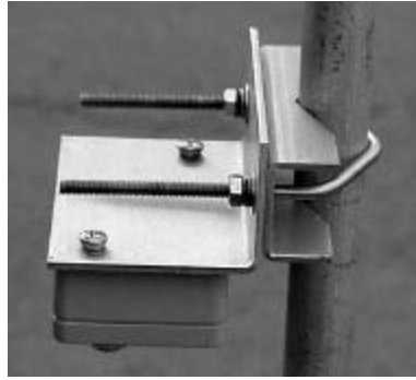
Close up of the bracket and mounting hardware attached to the amplifier.