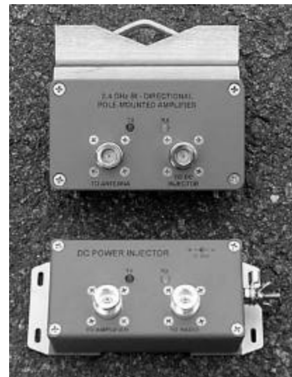
View showing the DC Injector and the pole mounted outdoor amplifier attached to its mounting bracket.

Kit Weight: Approx. 1.5 lb. with U-bolts