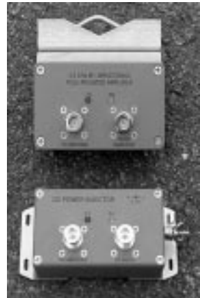
View showing the DC Injector and the pole mounted outdoor amplifier attached to its mounting bracket.

Kit Weight: Approx. 1.5 lb. with U-bolts