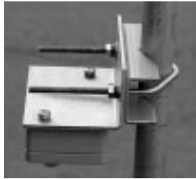
Close up of the bracket and mounting hardware attached to the amplifier.