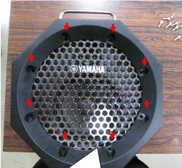
Eight screws are removed.