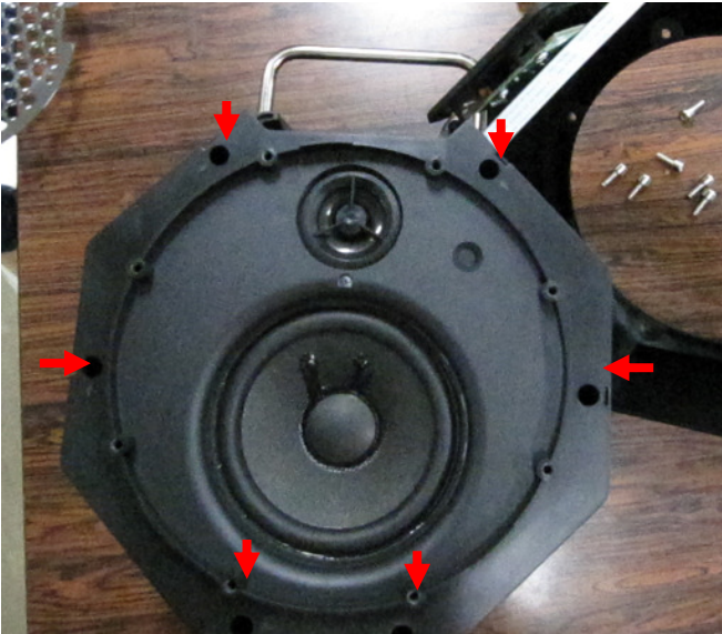
A cover is taken and six screws are removed.