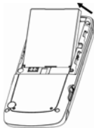
Pull up the battery from here