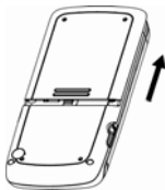
Remove the battery cover