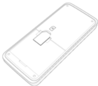
Insert the SIM card