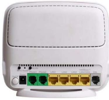
Figure 3-1 The Back Panel

The product is targeted to provide 24-hours continuous triple-play services, including VOIP. Figure 3-1 shows the interfaces and buttons on the back panel of the ZXHN H267N device.