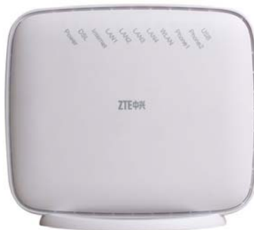
Figure 4-1 The Front Panel

Table 4-1 describes the indicators on the front panel of the ZXHN H267N unit.