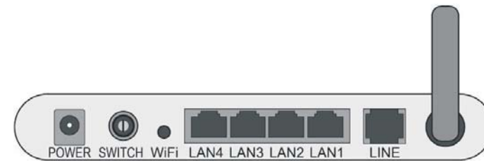
Figure 3.1-2 Rear Panel of the ZXV10 W300