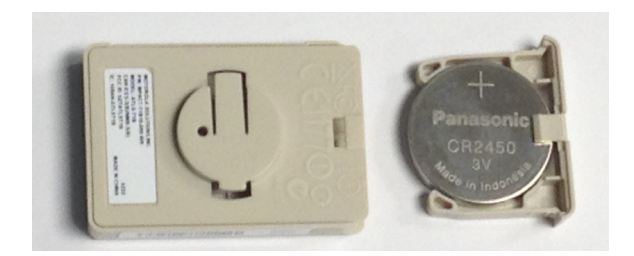
Figure 4-9 Battery Tray: MPACT-T1B20-000-WR and MPACT-T1B20-000-WR and MPACT-T1B10-000-WR

3. With both tray corners dislodged, gently slide the battery tray open, being careful not to drop the tray. Figure 4-9 shows an open battery housing. In this example, the battery tray is a separate piece, along with the battery, on the right-hand side.