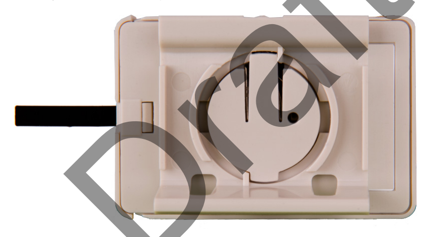
Figure 4-4 Universal Style Plastic Bracket with Beacon- Bracket Part Number MPACT-A1010-001-WR