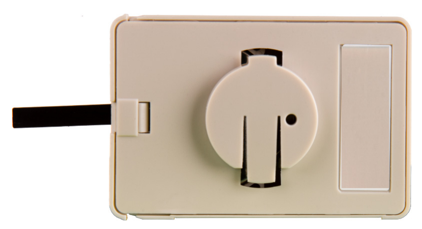
Figure 4-2 Universal Style Beacon - Part Number - MPACT-T1B10-000-WR

When installing numerous beacons, group beacons by category configurations and activate the beacons prior to scanning the barcodes and associating them with positions in the Toolbox.