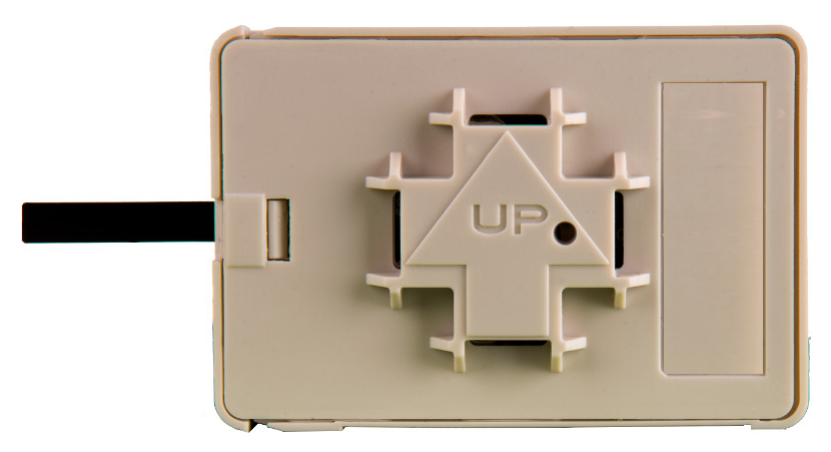
Figure 4-1 Tie Wrap Style Beacon - Part Number - MPACT-T1B20-000-WR

When installing numerous beacons, group beacons by category configurations and activate the beacons prior to scanning the barcodes and associating them with positions in the Toolbox.