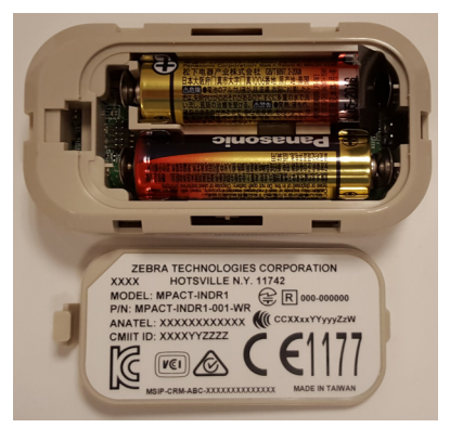
Figure 4-10 Upen Battery Enclosure: MPACT-MB2000-01-WR

4. Close the battery enclosure, ensuring the clip is secure.