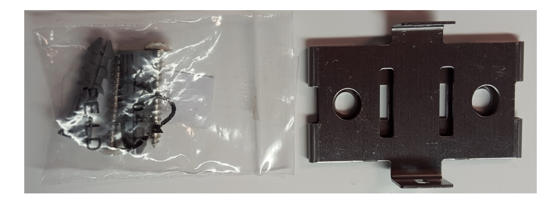
Figure 4-6 Metal Beacon Wall Mount Bracket: MPACT-MB2000-01-WR

There is one styles of bracket mount included with the Indoor Style Beacon: Part number - MPACT-MB2000-01-WR.