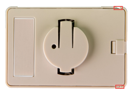
Figure 4-8 Beacon Battery Housing Example: MPACT-T1B20-000-WR and MPACT-T1B20-000-WR and MPACT-T1B10-000-WR

3. With both tray corners dislodged, gently slide the battery tray open, being careful not to drop the tray. Figure 4-9 shows an open battery housing. In this example, the battery tray is a separate piece, along with the battery, on the right-hand side.