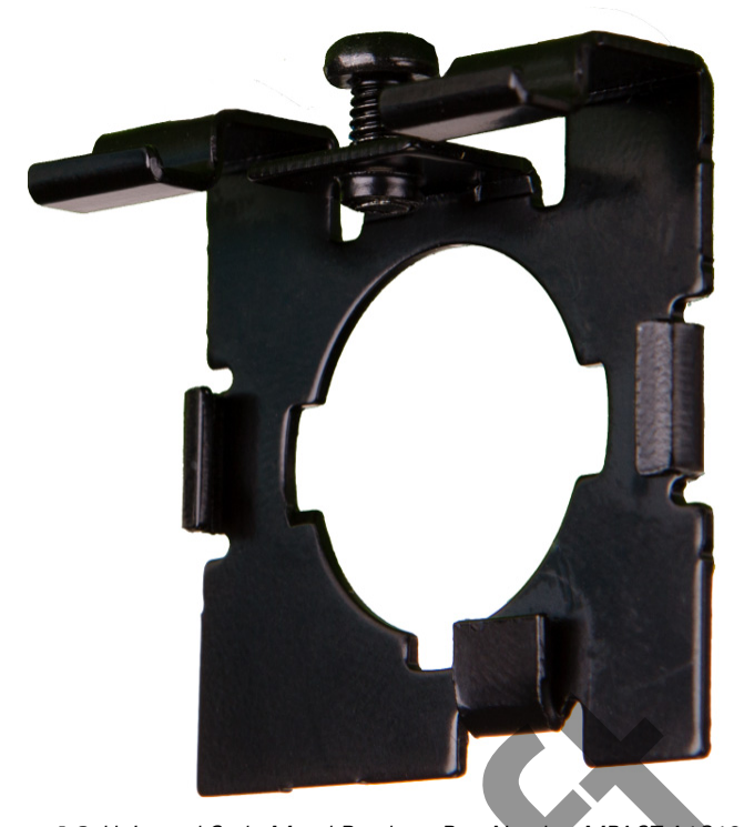
Figure 4-3 Universal Style Metal Bracket - Part Number MPACT-A1010-004-WR

There are two styles of bracket mounts from which to choose, either metal or plastic for Beacon: Part number - MPACT-T1B10-000-WR.