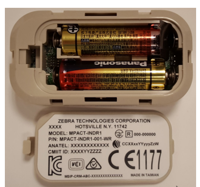
Figure 4-5 Indoor Style Beacon - MPACT-MB3000-Q1-WR

Figure 4-5 shows the back of a Indoor style beacon .