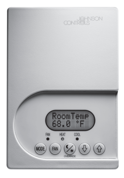
Figure 1: TEC2645-2 BACnet MS/TP Networked Thermostat with Single Proportional Output and One-Speed Fan Control

The TEC2645-2 Thermostat features an intuitive user interface with backlit display that makes setup and operation quick and easy. The thermostat also employs a unique, Proportional-Integral (PI) control algorithm that virtually eliminates temperature offset associated with traditional, differential-based thermostats.