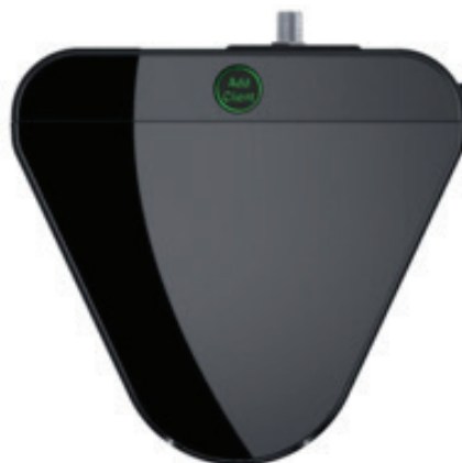
FIGURE 2: Genie 2 TOP PANEL