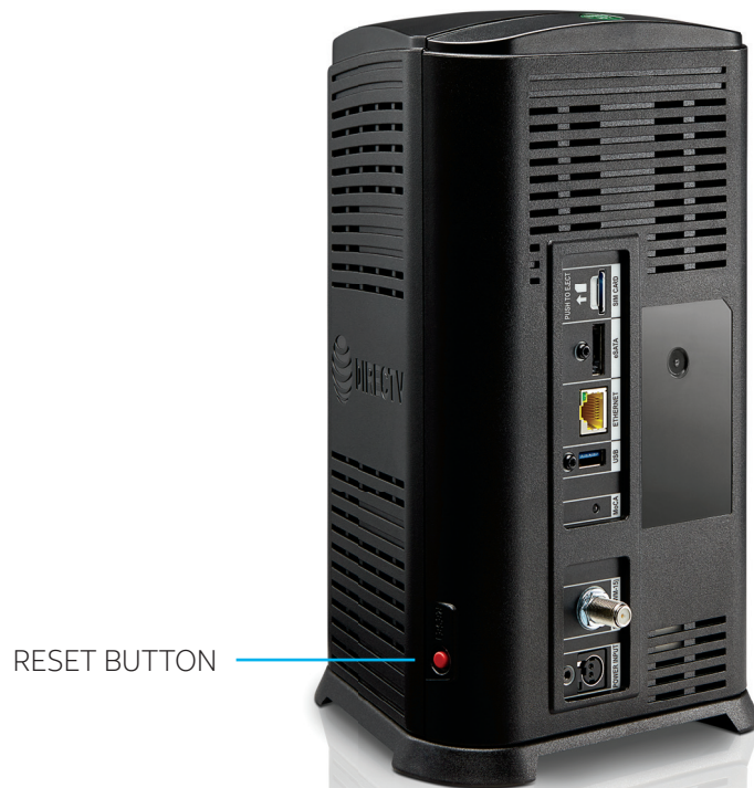
FIGURE 4: Genie 2 SIDE PANEL

To be used only when instructed by AT&T agent during troubleshooting