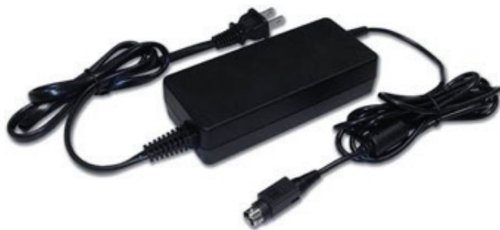
FIGURE 5: EPS17 POWER SUPPLY