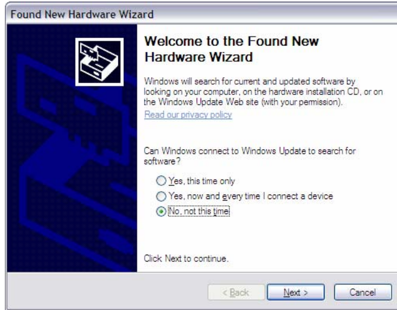
Figure #1: WLAN Driver Installation Window #1