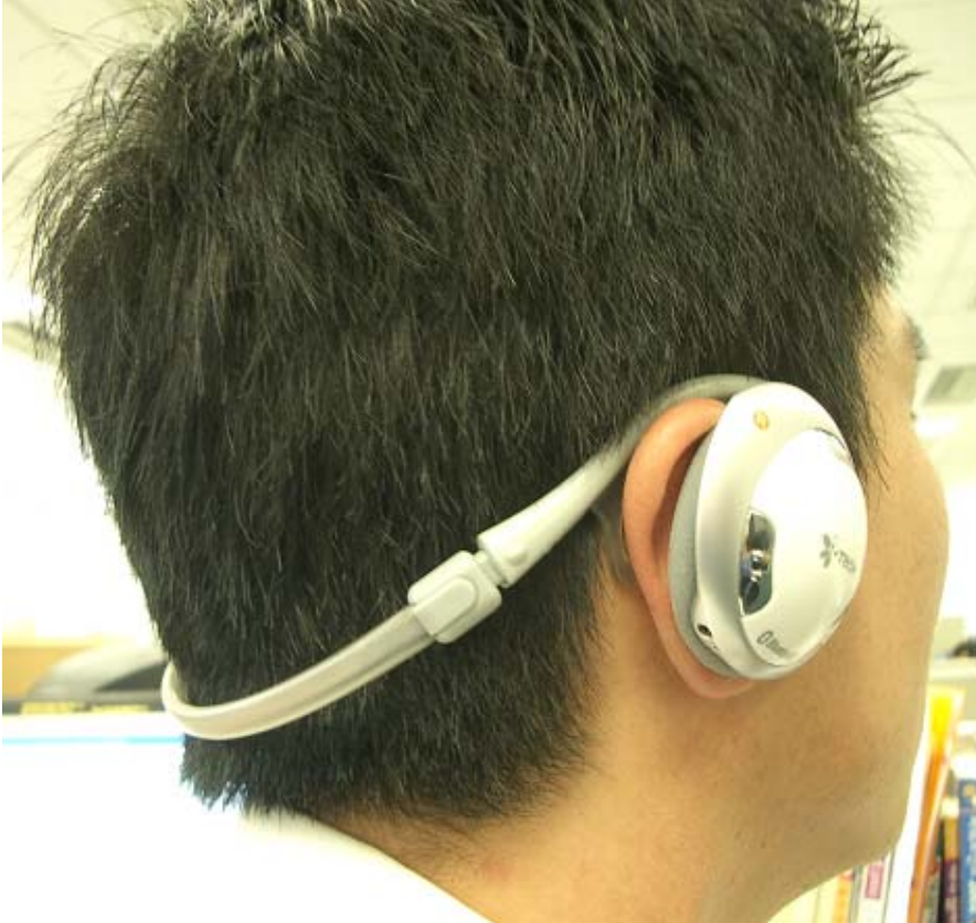
Fig. 3 Wearing your Earphone