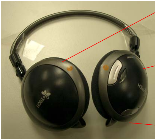
Fig. 1 (Right Channel Earphone)