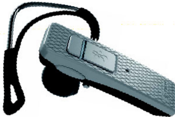
i.VoicePRO™ Bluetooth Headset