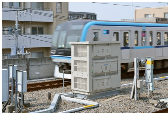
S-EIV ® installed on end of platform at Myoden Station

The S-EIV ® achieves a compact size and low weight through the use of silicon carbide (SiC) power modules and high-frequency link inverter, making it suitable for installation in tight spaces, such as the end of a station platform. The system's drip-proof, dustproof and anticorrosion housing also protects it from harsh outdoor conditions.