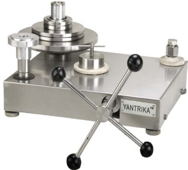
(Hydraulic Dead Weight Tester)