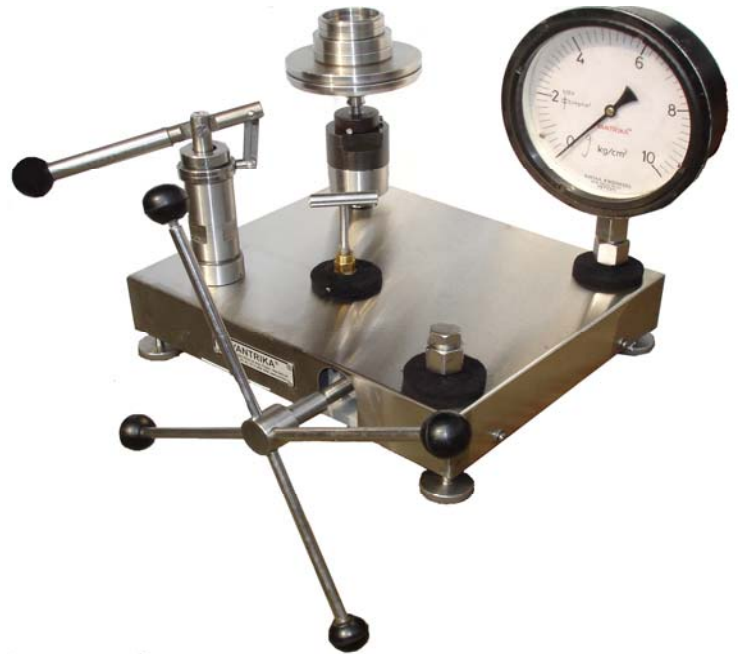
(Pneumatic Dead Weight Testers)