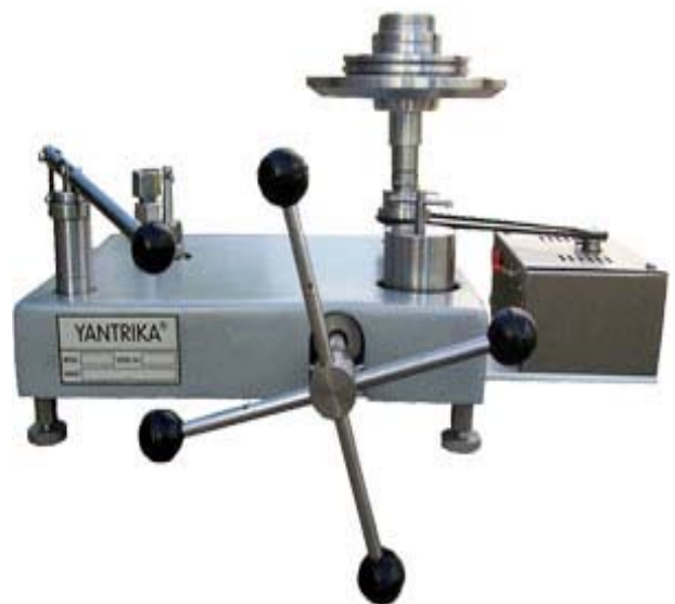
( Motorized Machine with Priming Pump )

National Physical Laboratory, India (NPL, INDIA) National Physical Laboratory, UK (NPL, UK) National Institute of Standards and Technology USA (NIST, USA)