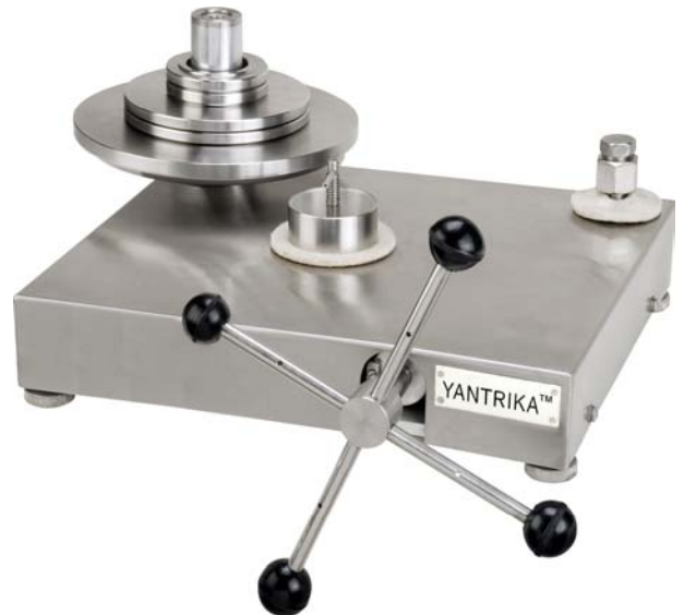
( Single Piston Machine )

Dead Weight Tester use the piston gauge pressure balance system consisting of finely lapped piston cylinder assembly of known area mounted along the vertical axis. Pressure forces the piston upwards and that force is balanced using accurately calibrated masses. Convenient value of piston area and masses allow user friendly measurement of pressure.