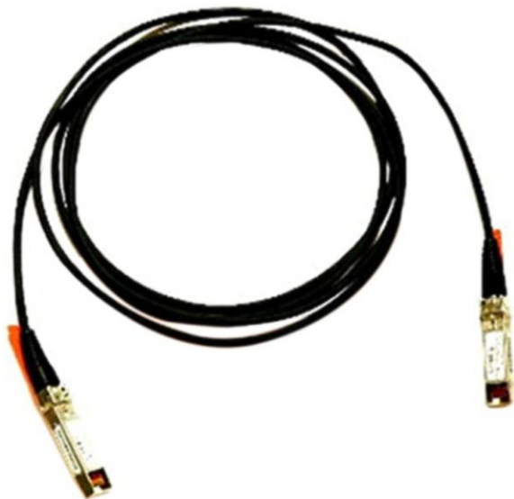
Figure 3. Cisco direct-attach twinax copper cable assembly with SFP+ connectors

Cisco SFP+ Copper Twinax (Figure 3) direct-attach cables are suitable for very short distances and offer a cost-effective way to connect within racks and across adjacent racks. Cisco offers passive Twinax cables in lengths of 1, 1.5, 2, 2.5, 3 and 5 meters, and active Twinax cables in lengths of 7 and 10 meters.