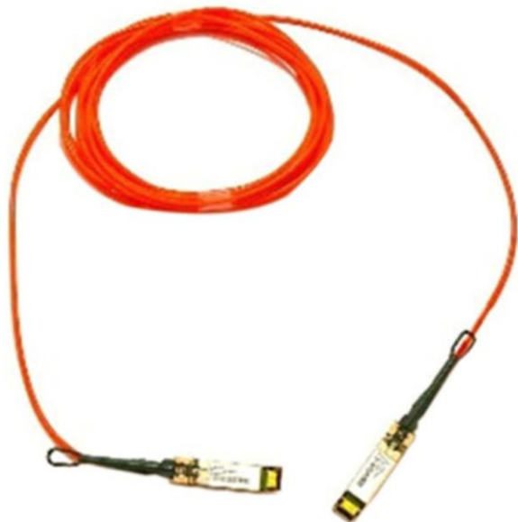
Figure 4. Cisco direct-attach active optical cables with SFP+ connectors