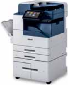
Xerox® AltaLink B8045 Color Multifunction Printer