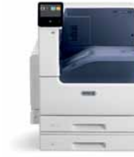
Xerox® VersaLink C7000 Color Printer