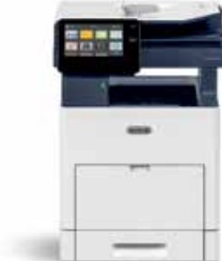
Xerox® VersaLink B615 Multifunction Printer