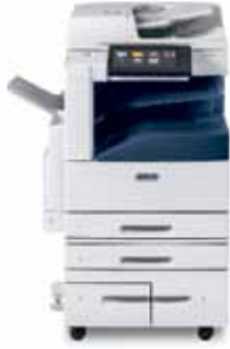
Xerox® AltaLink® C8035 Color Multifunction Printer