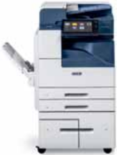
Xerox® AltaLink B8065 Multifunction Printer