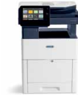
Xerox® VersaLink® C505 Color Multifunction Printer