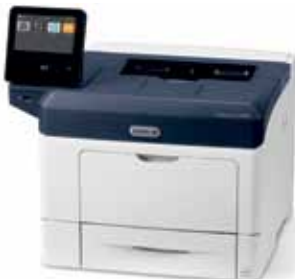
Xerox® VersaLink B400 Printer