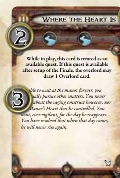
ADVANCED QUEST CARD FRONT