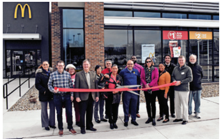
McDonald's, 9717 West 87th Street For more information: (913) 424-7914 or www.mcdonalds.com .