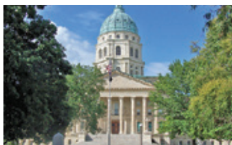
The Chamber is gearing up to advocate for you in the 2020 Kansas legislative session.