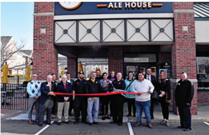
Tabard's Ale House, 12030 Blue Valley Parkway For more information: (913) 808-5688 or www.tabardsalehouse.com .