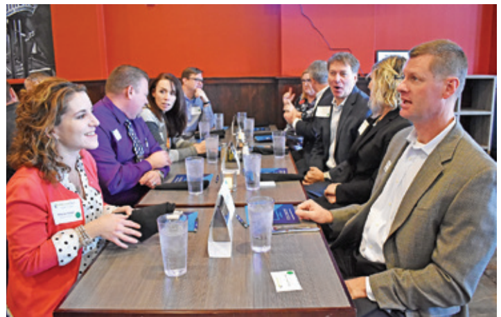
Chamber members got to know each other at Working Lunch hosted by Tabard's Ale House.