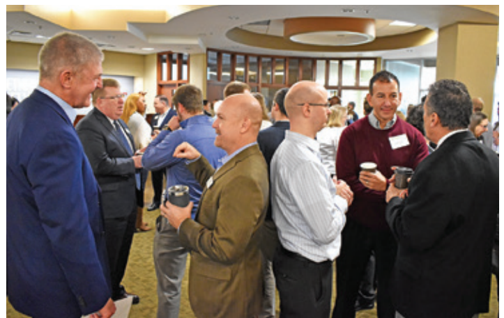
Networking at the December Wednesday Wake-up at Fidelity Bank.