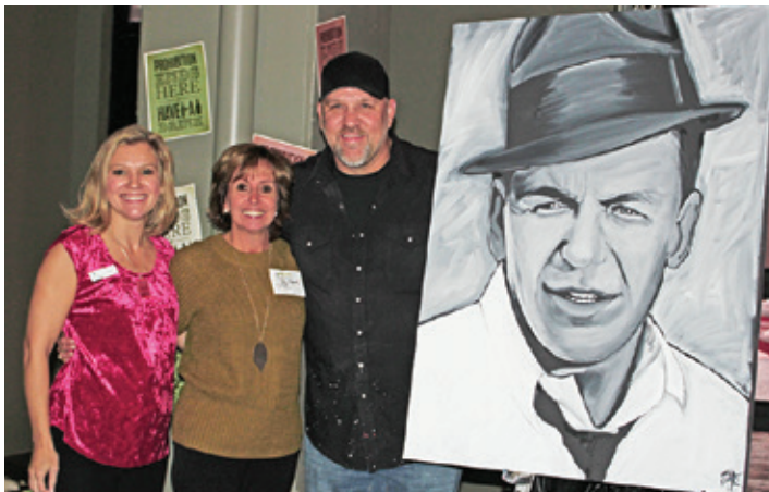
The auction of a Frank Sinatra portrait created at the Young Professionals holiday party helped boost funds raised to benefit HopeKids Kansas City.