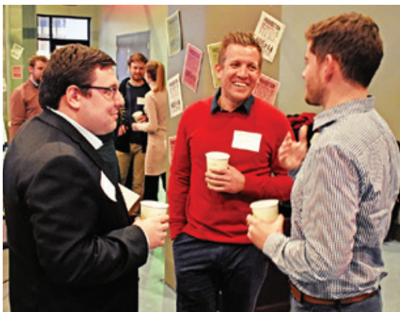
Young Professionals gathered in The Cave at Promontory Apartments for their annual holiday party.