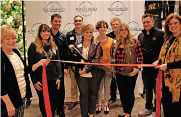
Align by Design Events For more information: (816) 377-6765 or www.alignbydesign.events .