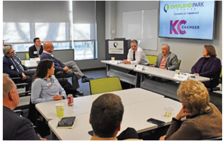
Our Public Policy & Advocacy joint meeting with the Greater Kansas City Chamber featured panelists discussing the political landscape.