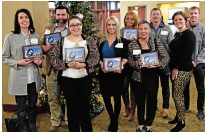
New Chamber members were recognized at December's Wednesday Wake-up networking event.