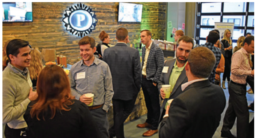
Food, drinks and door prizes made for a festive holiday party celebrated by the Young Professionals last month.