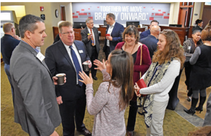
Networking at the December Wednesday Wake-up at Fidelity Bank.