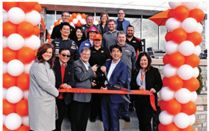
BIBIBOP Asian Grill, 11875 West 95th Street For more information: (913) 271-8169 or www.bibibop.com .