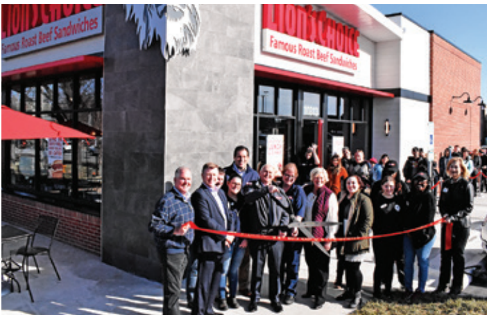
Lion's Choice, 10313 Metcalf Avenue For more information: (913) 347-8091 or www.lionschoice.com .