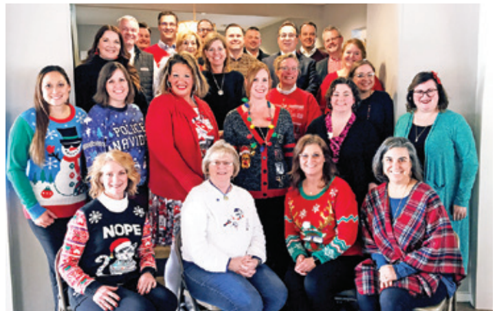
Chamber Diplomats enjoyed their annual holiday party at Villa Medici Apartments.