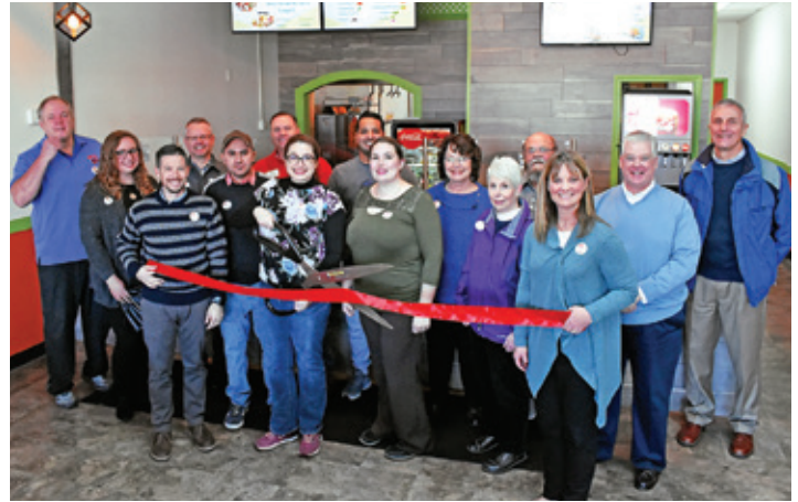
Falafel Express, 7805 West 151st Street For more information: (913) 730-8991 or www.falafelexpresskc.com .