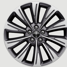
Corsair Reserve 19" Ultra Bright-Machined Aluminum with Magnetic-Painted Pockets Standard