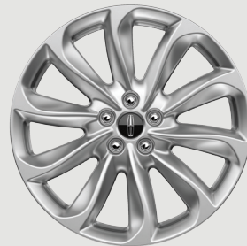
Corsair 19" Premium Painted Aluminum Included with Premium Package