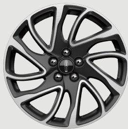
Corsair 18" Ultra Bright-Machined Aluminum with Dark-Tarnish Finish Optional Included with Equipment Collection 101A