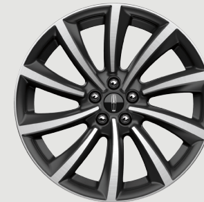
Corsair Reserve 20" Ultra Bright-Machined Aluminum with Dark-Tarnish Finish Optional Not available with Reserve Appearance Package