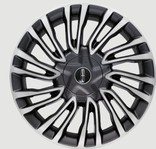
Corsair Reserve 20" Ultra Bright-Machined Aluminum with Magnetic-Painted Pockets Included with Reserve Appearance Package