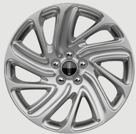
Corsair 18" Warm Alloy Painted Aluminum Standard

Start taking the fast, smart and friendly way through security with CLEAR