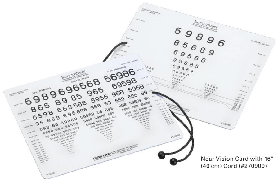
Near Vision Card with 16" (40 cm) Cord (#270900)