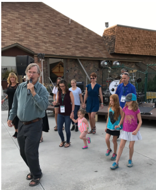
Line Dancing Lessons by the Pool