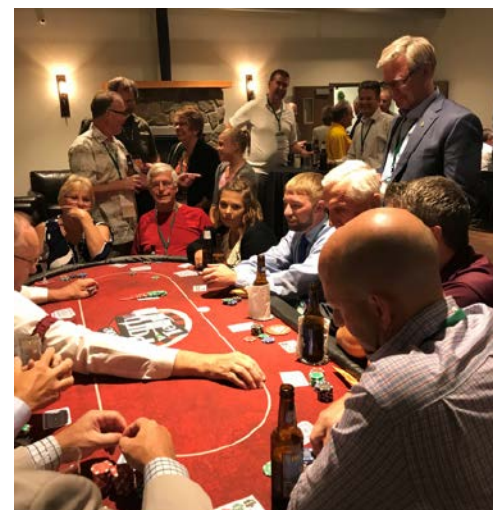
Live Poker Following the Presidents Banquet