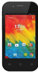
Android Smartphone model may vary.