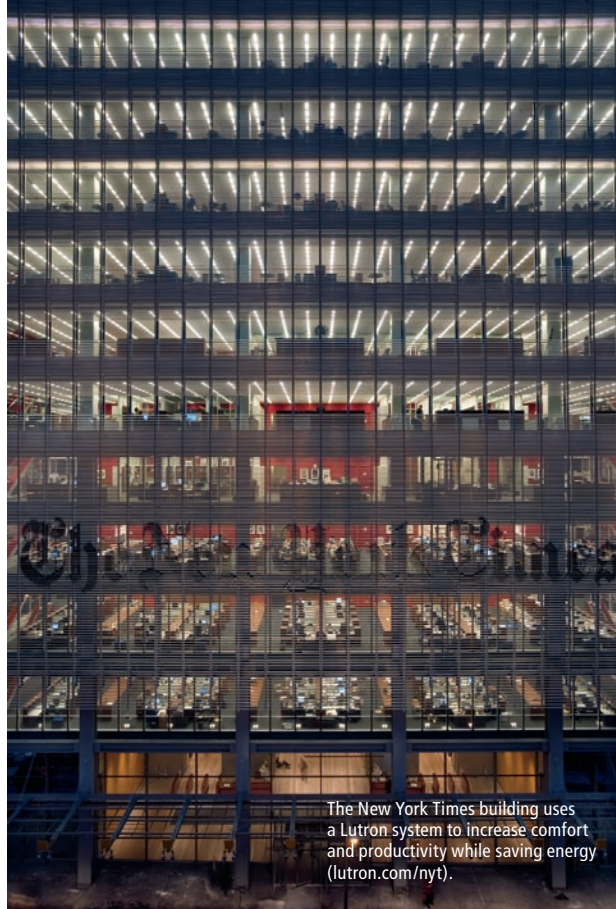
The New York Times building uses a Lutron system to increase comfort and productivity while saving energy (lutron.com/nyt).

Indeed, Lutron has gone well beyond that early dimmer. When fluorescent lamps began to dominate office lighting, Lutron tackled and solved the problem of dimming fluorescents. The company also developed devices to dim low-voltage, compact fluorescent and, more recently, light-emitting diodes (LEDs). Lutron was also the first to develop self-contained systems to control lighting