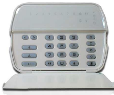
Model: DSC PK5500 Alarm Keypad

NOTE: Restoring your personal security codes is not a warranty issue.