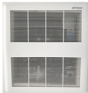
Typical bathroom/ensuite exhaust fan

NOTE: This system exceeds City Code that states you must run your fan for a MINIMUM of two, 4-hour operating periods per day to remove excess moisture from the air and aid in maintaining a healthy home by daily exchanging the ambient air in the suite.