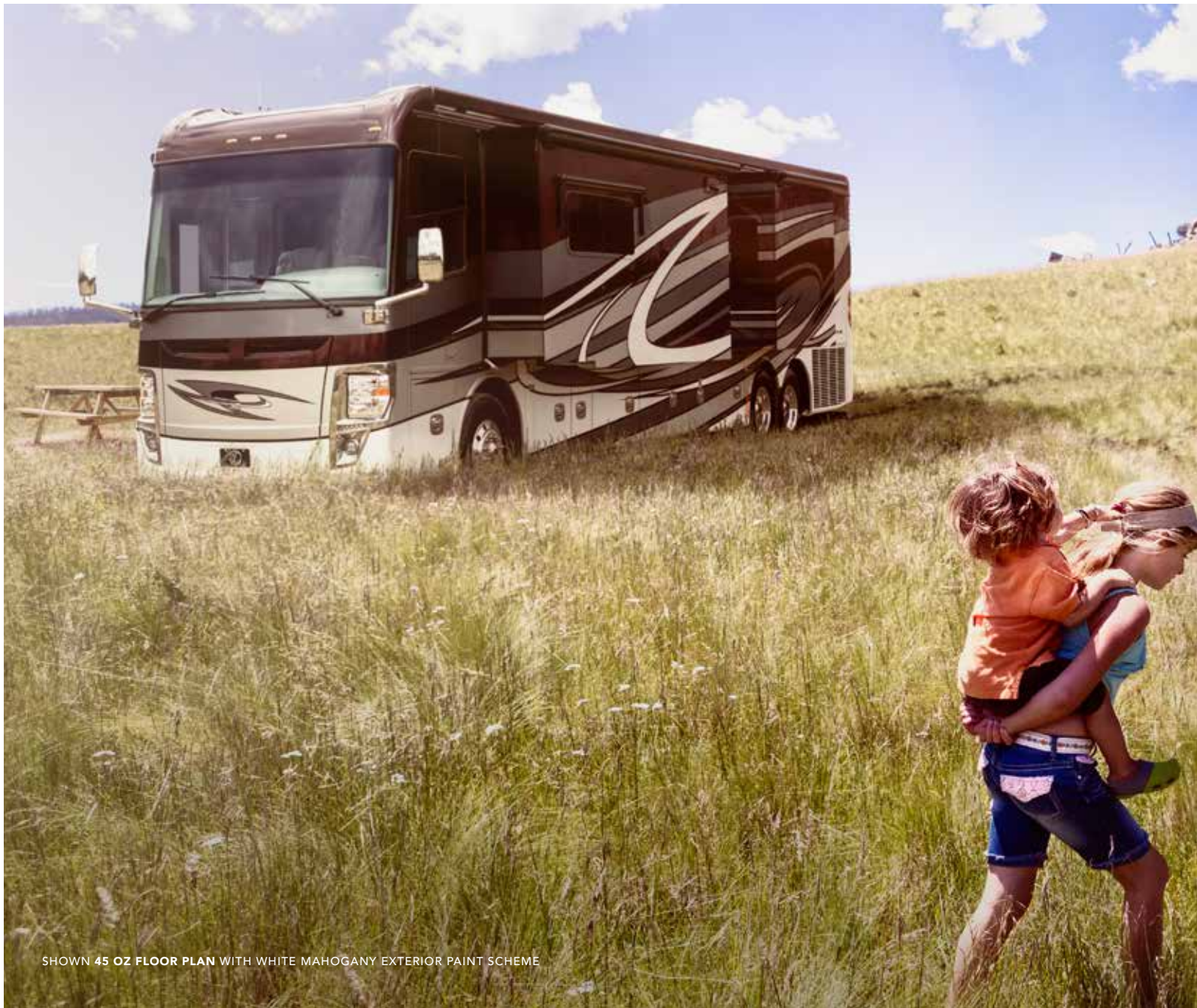
SHOWN 45 OZ FLOOR PLAN WITH WHITE MAHOGANY EXTERIOR PAINT SCHEME