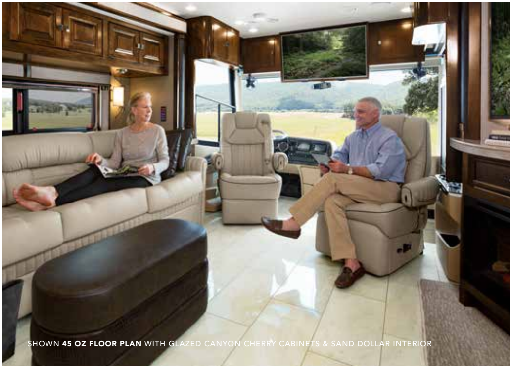
SHOWN 45 OZ FLOOR PLAN WITH GLAZED CANYON CHERRY CABINETS & SAND DOLLAR INTERIOR