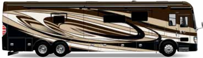
ROCKY MOUNTAIN BROWN