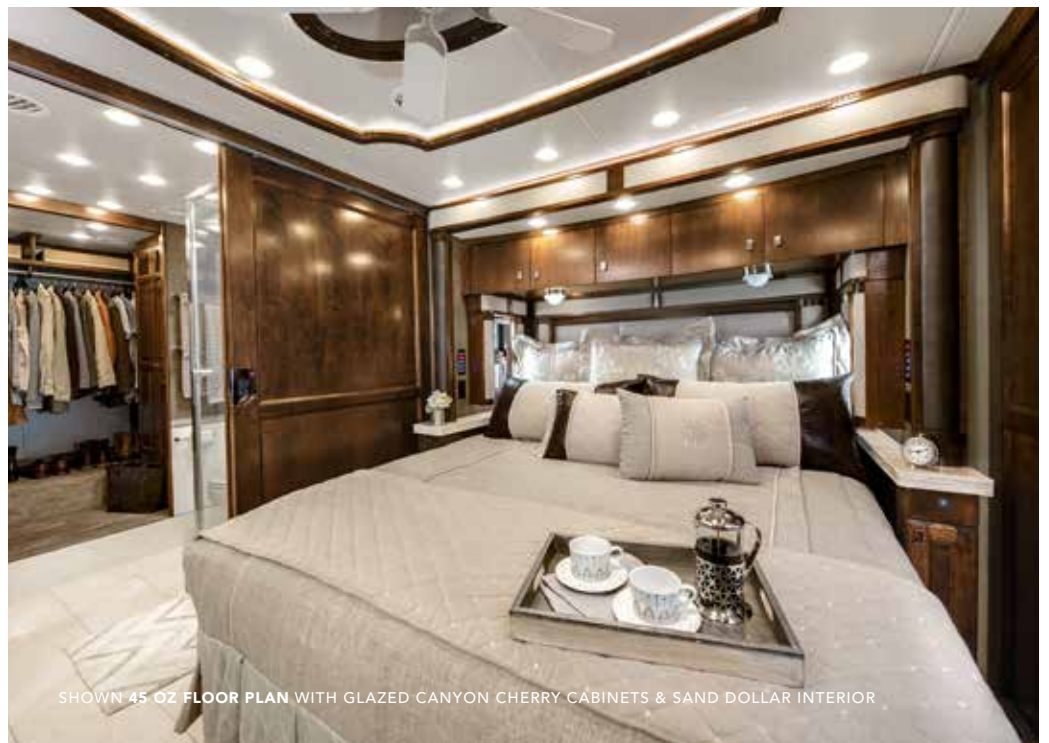
SHOWN 45' OZ FLOOR PLAN WITH GLAZED CANYON CHERRY CABINETS & SAND DOLLAR INTERIOR