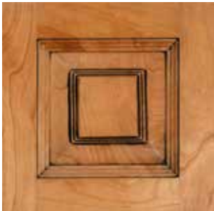
GLAZED HONEY NATURAL CHERRY