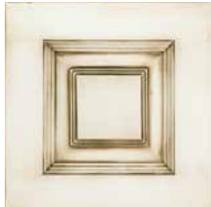
WHITE CHOCOLATE (BATH)