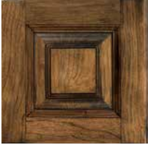
GLAZED CANYON CHERRY