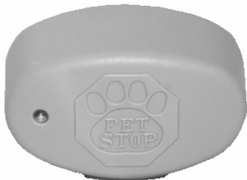
Low Battery Indicator