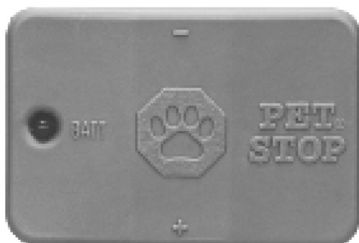
Low Battery Indicator

Remove this cover using a flat-ended screwdriver or coin to replace the battery.