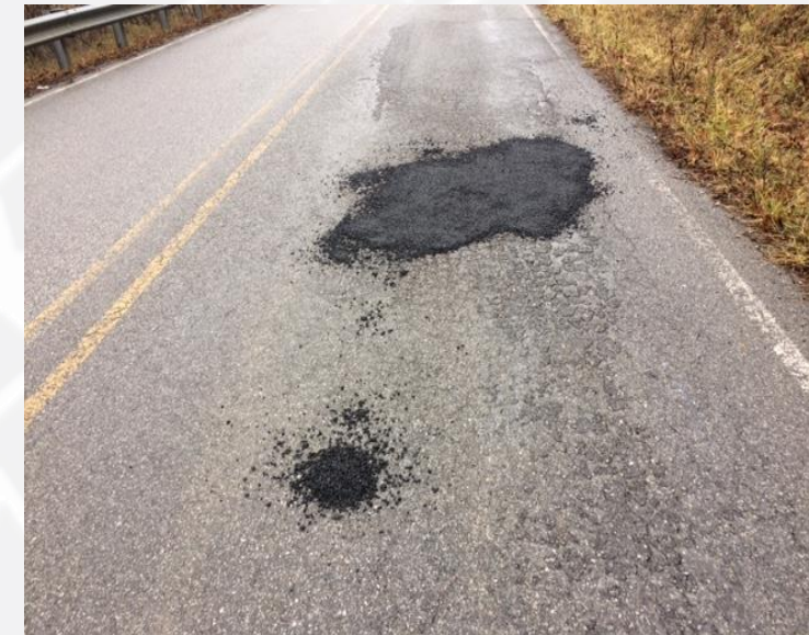
PEACH ORCHARD RD.