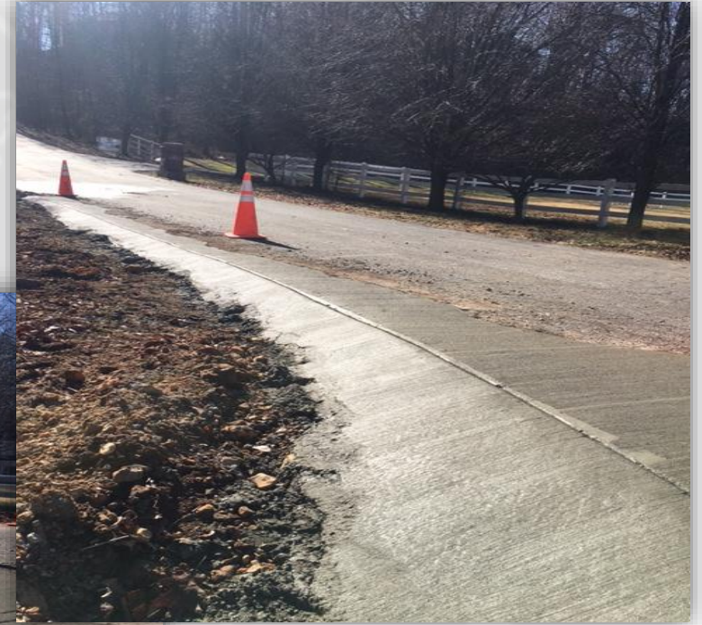
TWIN RIDGE DR.