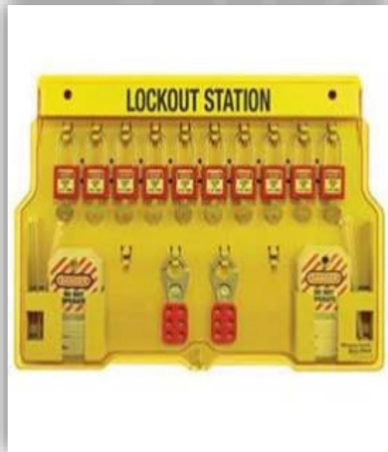
LOCK OUT – TAG OUT STATIONS