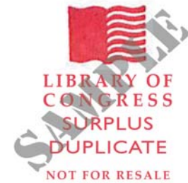
Figure 4: Example of Surplus Books Program identification stamp.

Management concurred with our recommendations.