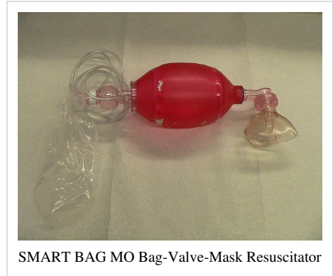
SMART BAG MO Bag-Valve-Mask Resuscitator