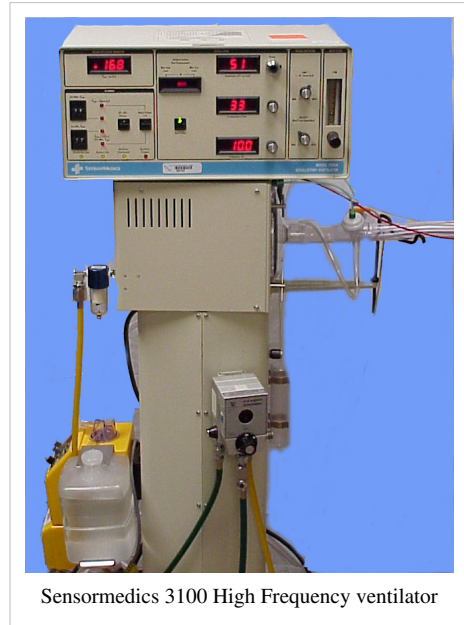
Sensormedics 3100 High Frequency ventilator

High Frequency Jet Ventilation employs a endotracheal tube adaptor in place for the normal 15 mm ET tube adaptor. A high pressure "jet" of gas flows out of the adaptor and into the airway. This jet of gas occurs for a very brief duration, about 0.02 seconds, and at high frequency: 4-11 hertz. Tidal volumes \leq 1 ml/Kg are used during HFJV. This combination of small tidal volumes delivered for very short periods of time create the lowest possible distal airway and alveolar pressures produced by a mechanical ventilator. Exhalation is passive. Jet ventilators utilize various I:E ratios--between 1:1.1 and 1:12-- to help achieve optimal exhalation. Conventional mechanical breaths are sometimes used to aid in reinflating the lung. Optimal PEEP is used to maintain alveolar inflation and promote ventilation-to-perfusion matching. Jet ventilation has been shown to reduce ventilator induced lung injury by as much as 20%.