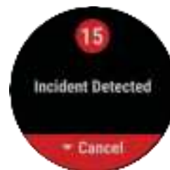
SAFETY AND TRACKING