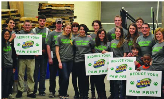
University of Pittsburgh