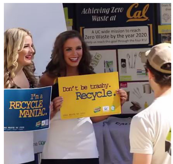
University of California, Berkeley