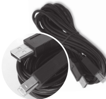
15' USB Cable