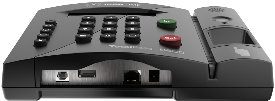
TotalPass B600 Time Clock

The TotalPass B600 time clock includes three connection options: Wi-Fi, Ethernet, or USB.