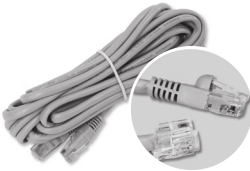
15' Ethernet Cable