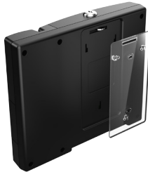
Back View with Mounting Bracket