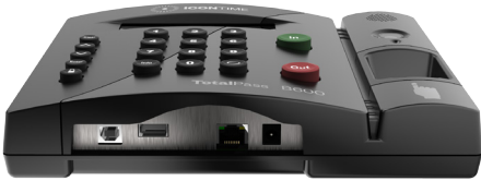
TotalPass B600 Time Clock