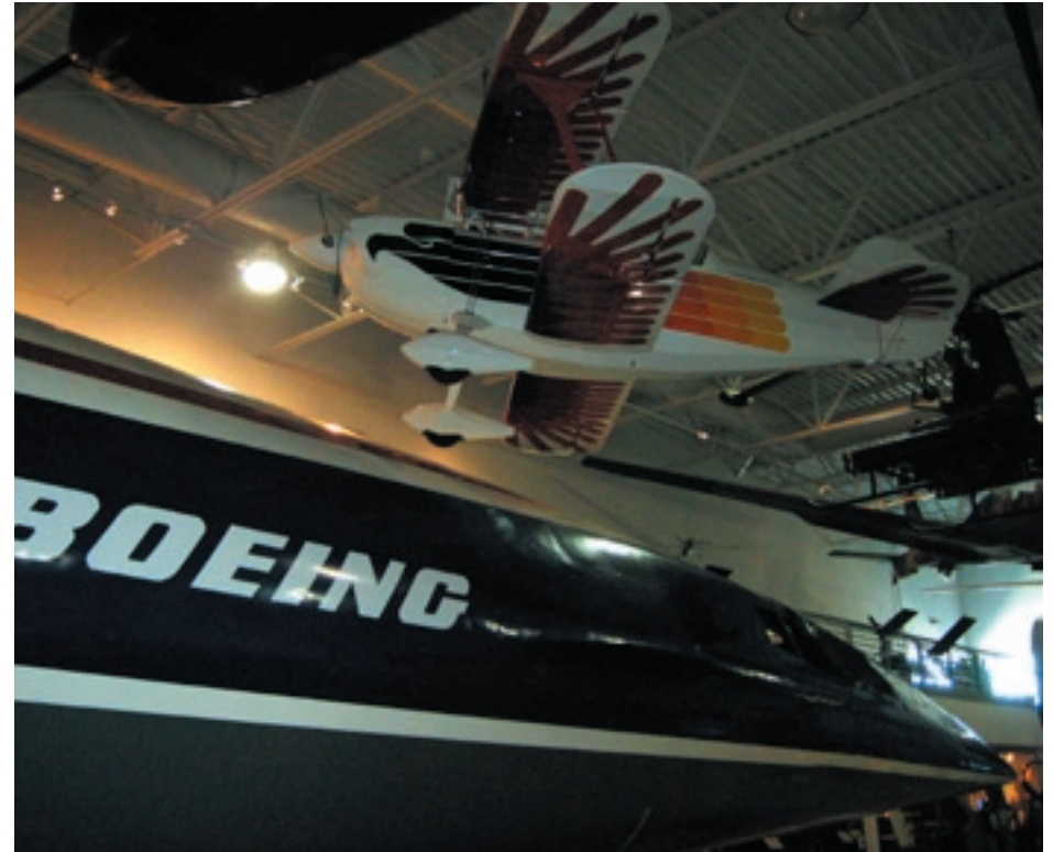
A Christen Eagle II biplane soars over a mockup of the never-built Boeing SST.