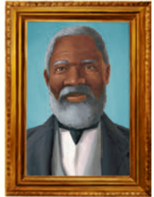
G R A N D - P È R E Cécile's loving grandfather, a retired sailor with many tales to tell