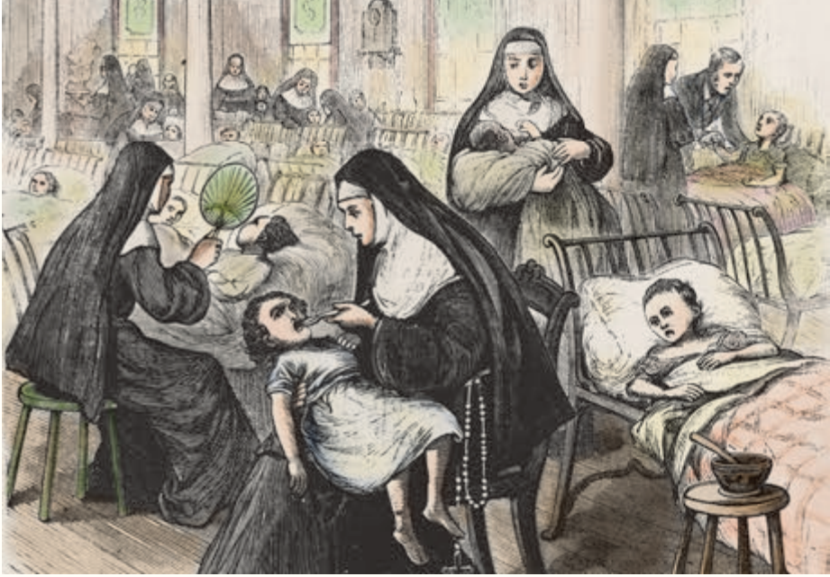
Nuns in a New Orleans orphanage tend the sick during a yellow fever epidemic.

A terrible outbreak of yellow fever really did strike New Orleans in the summer of 1853. All across the city, families fought against illness and death, just as Cécile's family does in the story. That summer, almost 30,000 people fell ill, and 10,000 people died. "The whole city was a hospital," said one New Orleans man. Another wrote, "Never have I known such cause for sadness."