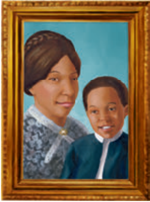
TANTE OCTAVIA AND RENÉ Maman's widowed sister and her son, who live with Cécile's family