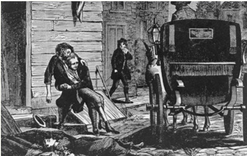
When yellow fever struck Philadelphia in 1793, carriages rolled through the streets night and day to collect the dead and dying.

All of America's cities suffered epidemics. In 1793, Philadelphia—then the nation's capital—was struck by a yellow fever epidemic that killed 5,000 and forced George Washington and Thomas Jefferson to flee. In 1832, a deadly cholera epidemic brought New York City to a standstill and then swept on to Boston, Cincinnati, Philadelphia, and Baltimore. In 1918, more than 500,000 people across the country died in a flu epidemic.