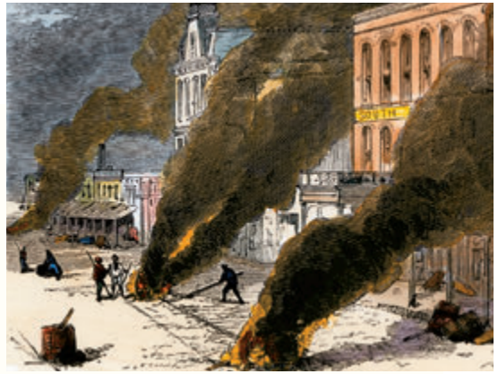
During epidemics many cities burned barrels of tar, hoping the smoke would drive away disease.

A private service group, the Howard Association, organized efforts to get medicine, food, and medical care to those who needed it, free of charge. The city's doctors, like Marie-Grace's father, tended patients night and day, and when the hospitals ran out of room, doctors turned a ballroom into a well-organized temporary hospital. Nurses served heroically in homes and hospitals, earning great respect for the fine care they provided. Catholic nuns, who ran many of the city's orphanages and hospitals, also worked tirelessly to help the sick and suffering. Often, doctors,