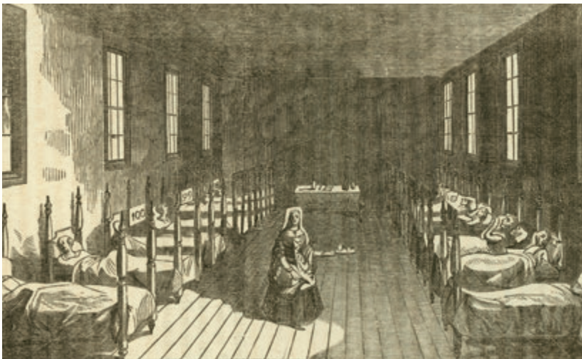
A sick ward in New Orleans' Charity Hospital, crowded with fever victims

Many families packed their bags and fled to the countryside. Ships bringing food and supplies avoided New Orleans for fear of the fever. Business and social life came to a stop. Hospitals and orphanages overflowed. Grave diggers worked around the clock, and still coffins piled up at the cemeteries waiting for burial. Desperate to drive away whatever was causing the fever, the mayor had cannons