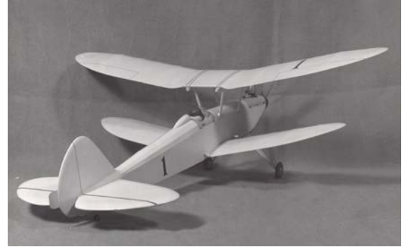
The Roaring 20