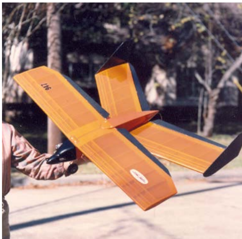
1992: Bert's prototype of the Delanne Dragon Fly