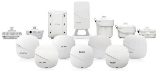
The Aruba Classified Mobility product family.

Aruba Mobility Solutions for Classified Networks provide government IT organizations the technology they need to embrace mobility in a meaningful way. It does so by securely unifying disparate computing infrastructures into one seamless network access solution – for government employees, contractors, visitors, and military personnel in-garrison or in-deployment.