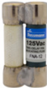
125Vac 12 to 15A