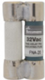
32Vac 20 to 30A