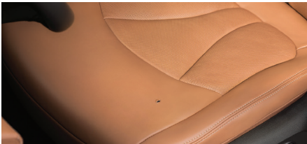
Upholstery holes smaller than 1/8"