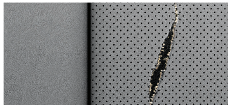
Tears larger than 1/2"