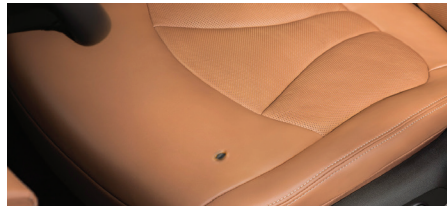
Upholstery holes larger than 1/8"