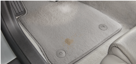
Removable stains and minor carpet wear