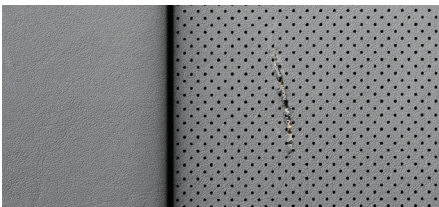
Tears smaller than 1/2"