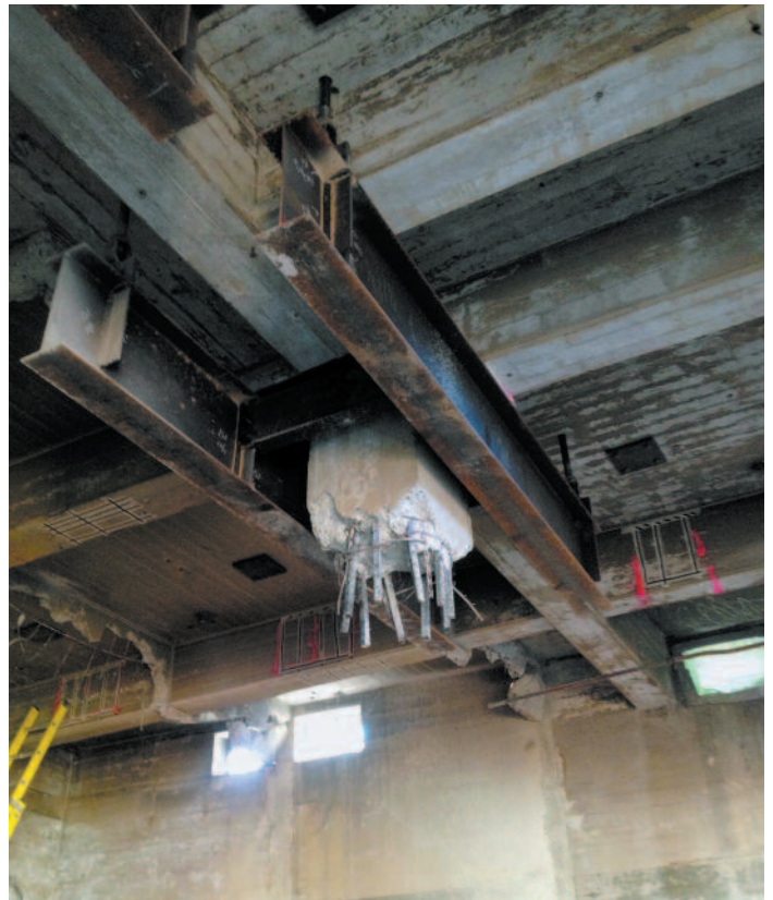
Support beams hanging from W36 girders above capture loads from columns in the Admin Building basement. Columns were demolished after jacking procedure transferred building weight to temporary supports.

To temporarily support the weight of the building, 27 soldier piles were installed to depths of 70 feet around the perimeter of the structure. On top of the piles horizontal spreader beams spanned the distance between support piles. Resting on top of the spreader beams, all loads were collected by 18 each W36x393 girder beams 48 feet long. The girders, referred to on the project as “needle” girders, were threaded through the window openings on the east