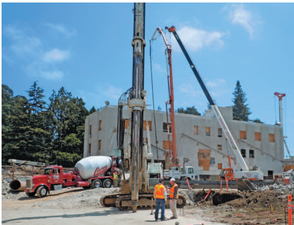
Tremie placed concrete for piles at the Admin Building.

R-312/2* drilled 30 inch diameter holes to depths ranging from 45 to 77 feet deep. Concrete for the project was supplied by Central Ready Mix and placed using Condon-Johnson's Schwing 32M Boom Pump. To control groundwater during pile