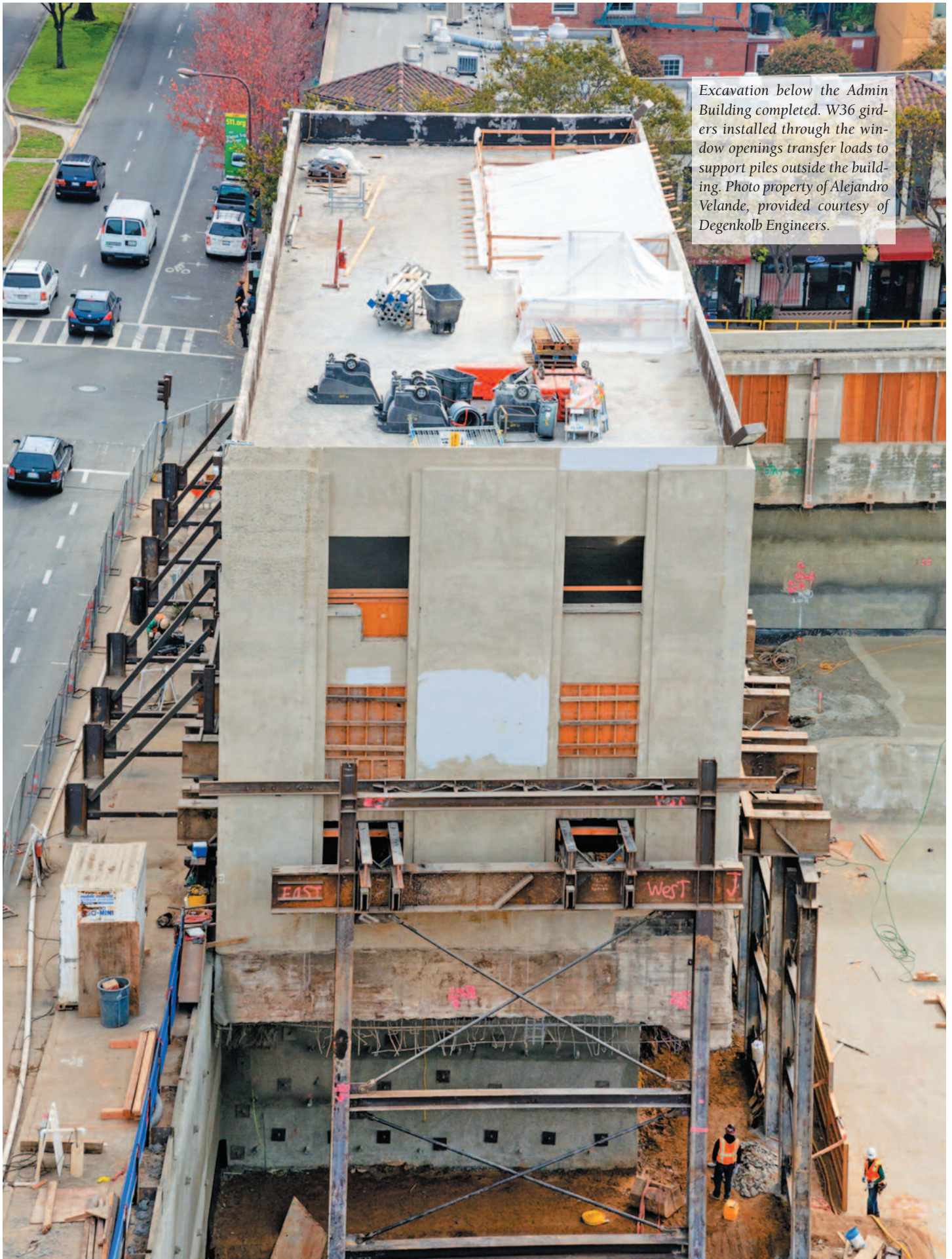
Excavation below the Admin Building completed. W36 girders installed through the window openings transfer loads to support piles outside the building.