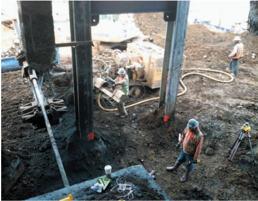
Drilling soil nails to support columns in the Admin Building basement while building "floats" overhead.

and the beams pushed and pulled into place using excavators, hoists, chain falls, and come-alongs.