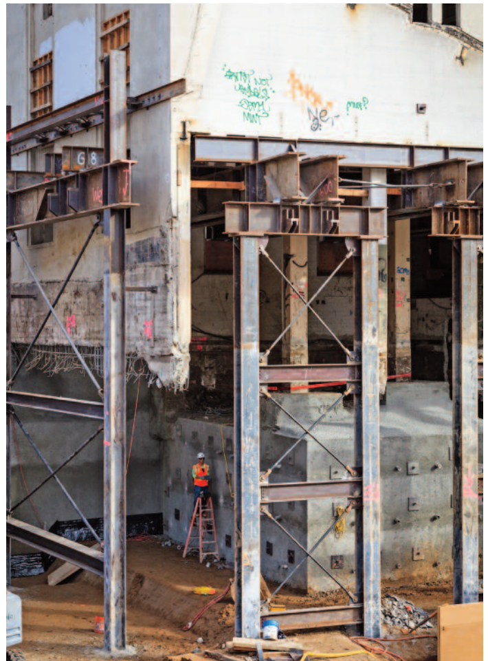
Bracing between building support piles installed as excavation progressed.

High groundwater, varying soil layers, buried obstructions, and tight working spaces were all challenges that were overcome during soldier pile installation. Condon-Johnson's Soilmec SR-60 and