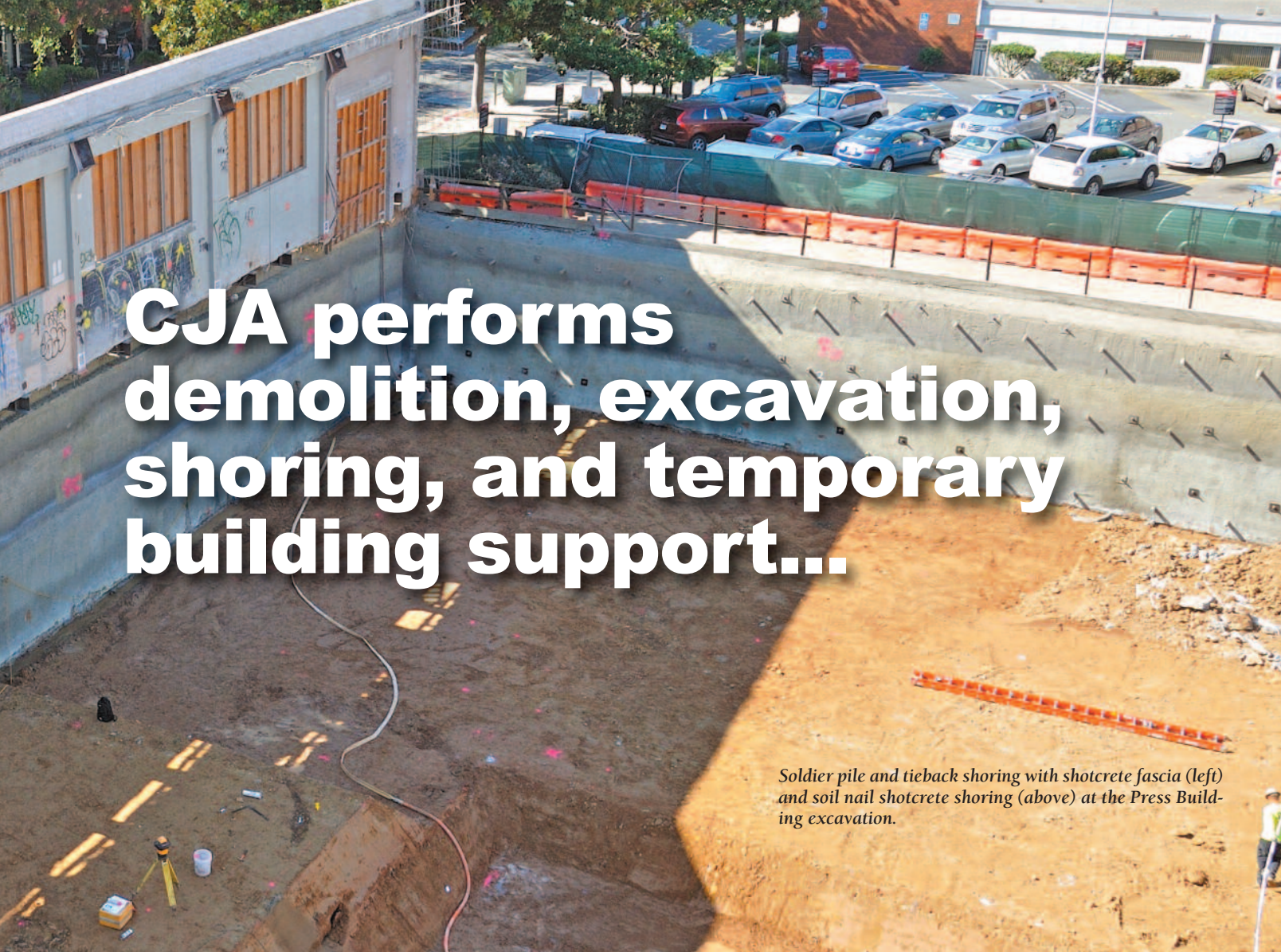
Soldier pile and tieback shoring with shotcrete fascia (left) and soil nail shotcrete shoring (above) at the Press Building excavation.

plan, presenting approximately fifteen art exhibitions and 380 film programs each year.