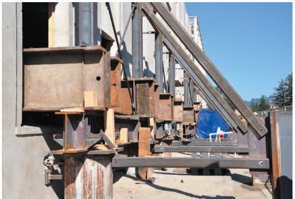
East Buttress frame at Admin building captures vertical loads through W36 girders and horizontal loads through high strength rods attached to floor slabs at 1st and 2nd levels.

The Press Building consisted of a basement and a single story structure covered by a "sawtooth" truss roof design. The roof trusses were determined to have historic and architectural value and were to be incorporated in the new museum roof. The trusses were carefully removed and stored off site by the demo subcontractor, Stomper. Plans called for the upper portion of the south