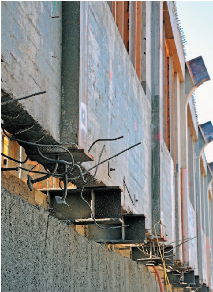
Stub beams attached to shoring piles behind the Press Building Wall "floats" the wall above excavation and shoring

piles were installed on the project in just three weeks.