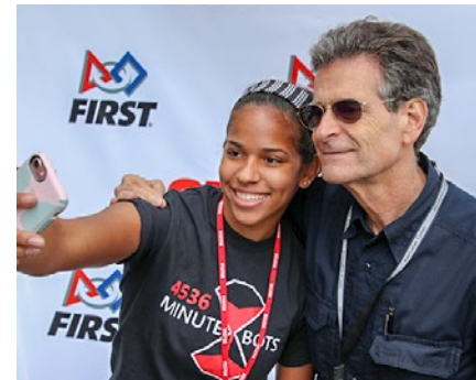
Students met science celebrity Dean Kamen at 3M's "Robots Invade the Plaza" event.

LEGO® League teams, dozens of 3Mers who volunteer their time as mentors, coaches and judges for FIRST ® Robotics, as well as hundreds of 3Mers and their children also joined the fun. This event featured robot demonstrations and a parade of FIRST ® Robotics teams. Another highlight was special guest and keynote speaker Dean Kamen, founder of the FIRST ® organization. An inventor, entrepreneur and advocate for STEM, the students were eager to take selfies with Kamen and ask him to sign their robots.