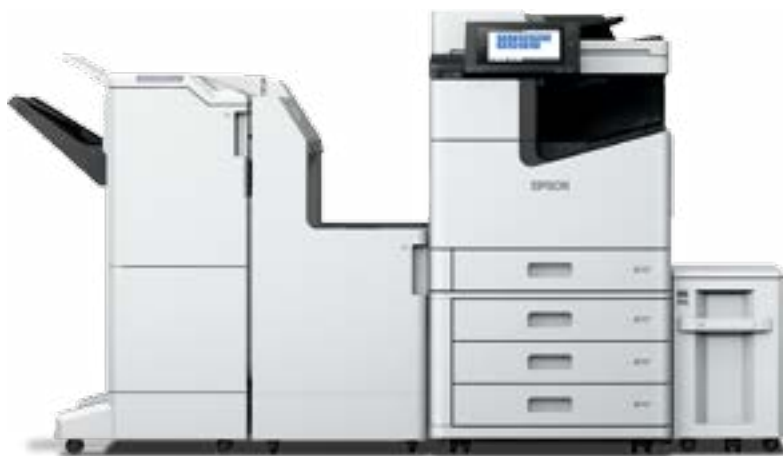
Shown with optional accessories (sold separately).